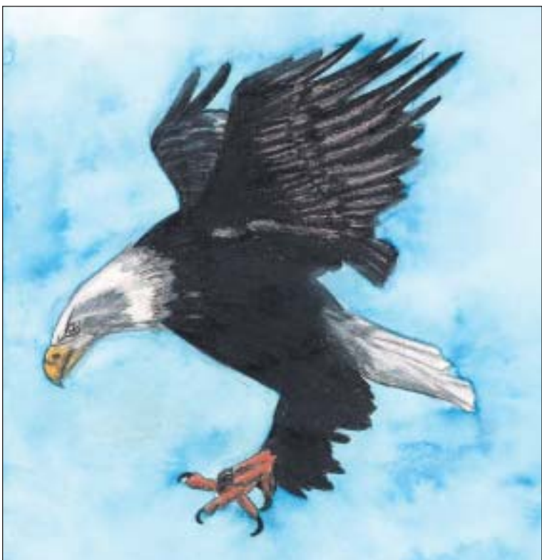
BRIANA ANTEZANA, 13, eighth grade