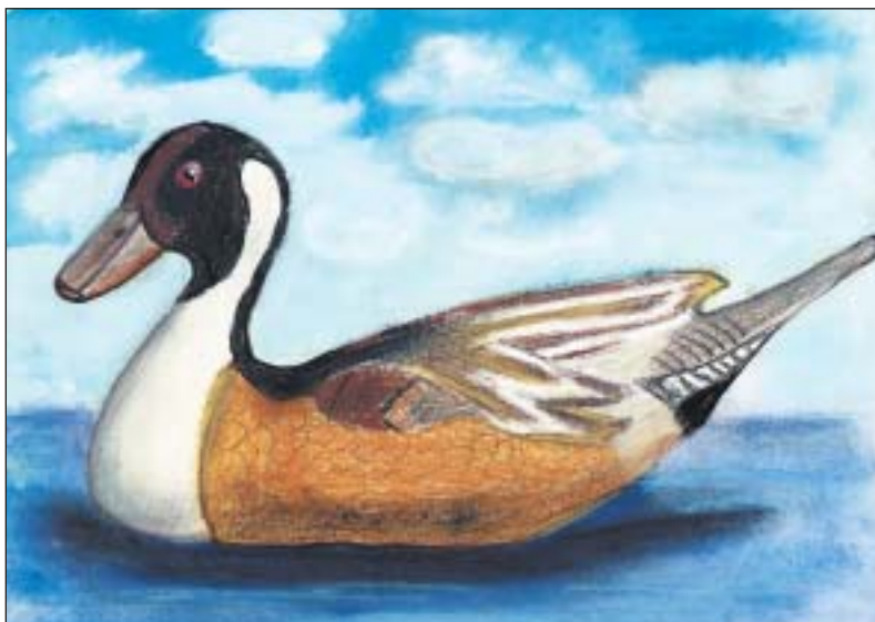
CASSIE GREEN, 14, eighth grade