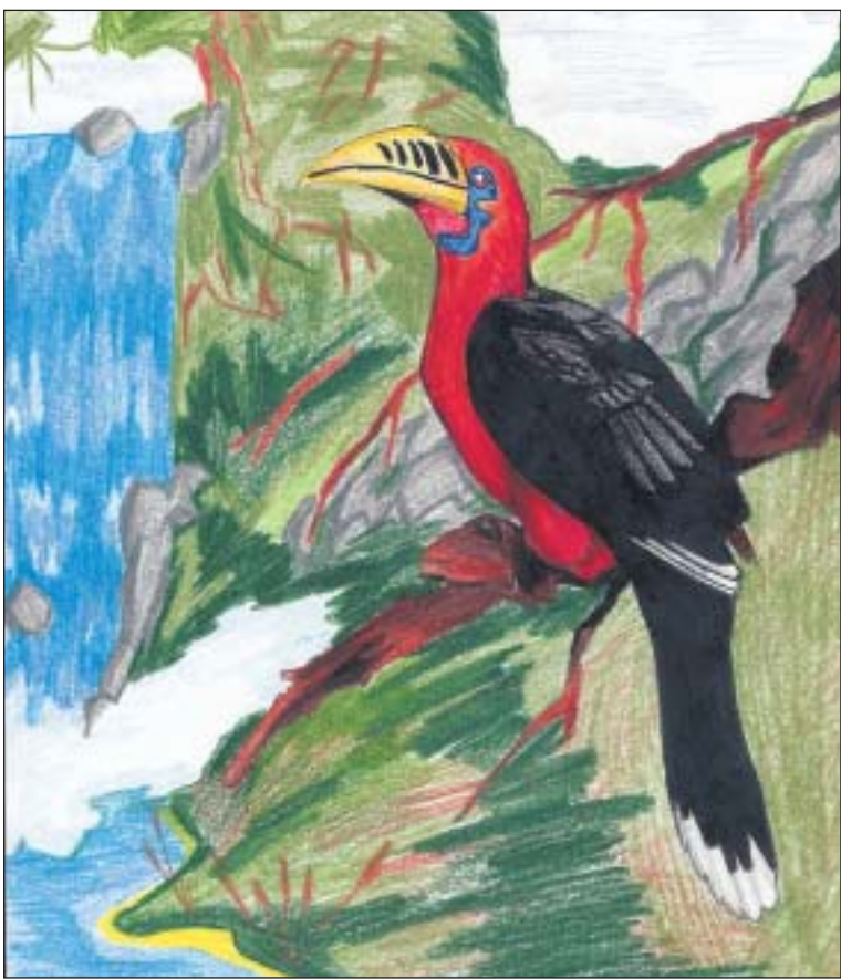
LUKE WAHLERS, 14, eighth grade