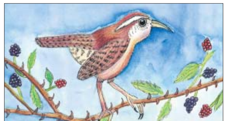
By VICTORIA NORMAND, 14, eighth grade