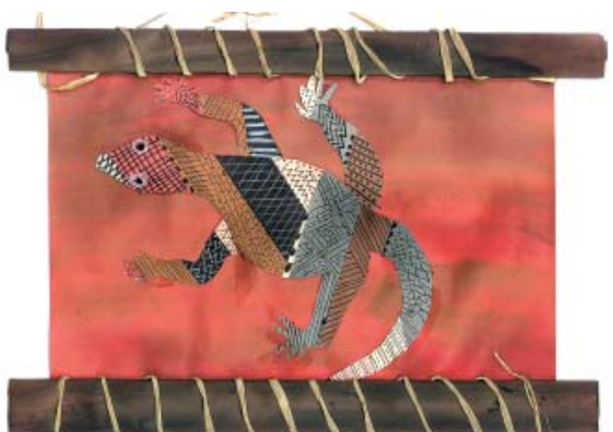
By TRACY THOMPSON, eighth grade